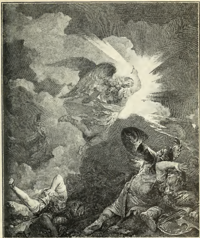
THE ANGEL DESTROYING THE ASSYRIAN CAMP From the Painting by P. J. Louterbourg, R. A. Engraved by W. Sharpe.